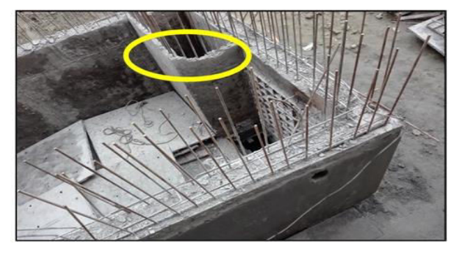
Fig. 5: Protected concrete surface.

Fig. 4 & 5 shows the practice of protected concrete surface in different part of WWTP. So, Barrier system involves complexities in selection proper barrier system, preparing application surface etc. Engineers also find it difficult to select the proper barrier system when the economy is given more preference than their performance.