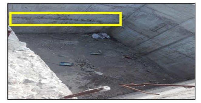
Fig. 4: Protected concrete surface.

Fig. 3 shows the practice of protected beam and unprotected column in WWTP. If improper curing or increased w/c ratio weakens the surface of the concrete on which the barrier system is applied, the concrete may fail to owe to the applied stresses on it even for a light barrier system (ACI, 1979). Moreover, any the concrete motion due to temperature variation or applied stress can disable the barrier system (ACI, 2001). Encapsulation of concrete also creates a problem when water trapped in the concrete increases the risk of damage by freezing and thawing. Sometimes the exposed elements are not properly covered.