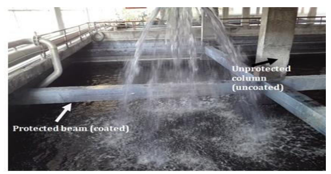
Fig. 3: Protected beam unprotected column.