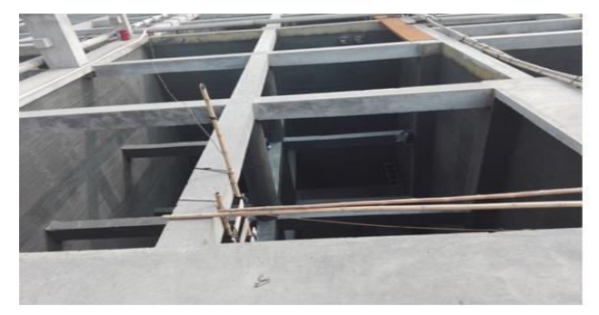
Fig. 2: Protected concrete surface.

For the construction of structures like a wastewater treatment plant in-depth guideline is not available in Bangladesh regarding the material selection and the suitable methods (Mahmud et al. , 2016). The detrimental effect of chemicals and microorganism on the concrete surface can be prevented or controlled by developing resistant property of concrete by either improving concrete's microstructure or application of barrier systems. Based on practical field survey, it can be said that engineers are more focused in barrier protection of concrete used in WWTP than its internal improvement against the exact exposure condition. Using a barrier system without improving concrete performance can also be problematic in many ways.