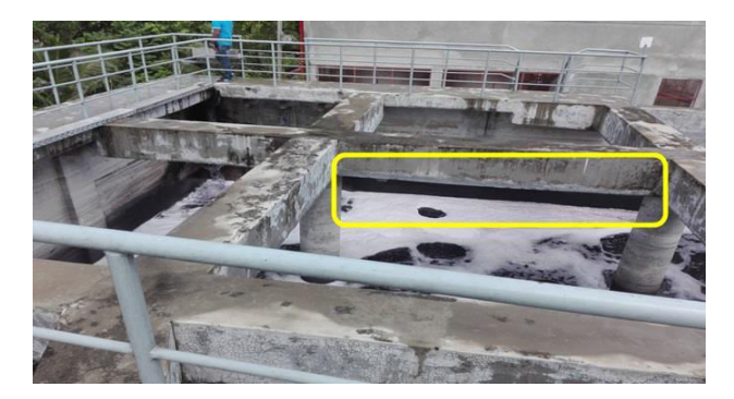
Fig. 1: The Effect of Microorganism on Concrete Surface.

The organism that settled on the concrete surface transforms the hydrogen sulfide into sulfuric acid which results in the corrosion of steel bars (Jahani et al. , 2001).